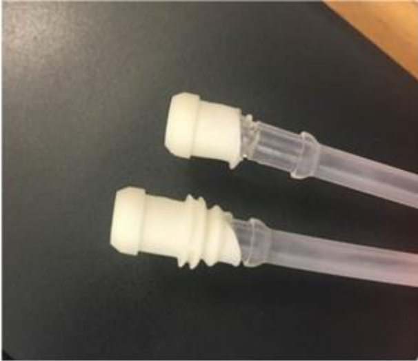
Fig. 1 Outer layer incomplete