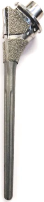
Stem & Body Engagement with Correct Screw Assembly