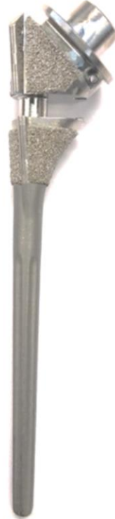
Stem & Body Engagement with Incorrect Screw Assembly