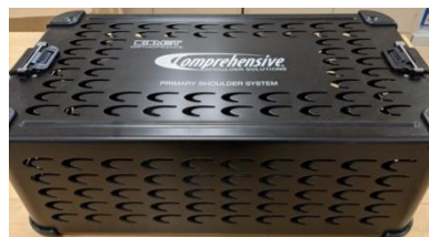
Figure 2: Comprehensive Primary Shoulder Instrument - Outer Case Vault Only

Special Note: Inner trays and all contents are to be kept and not returned.