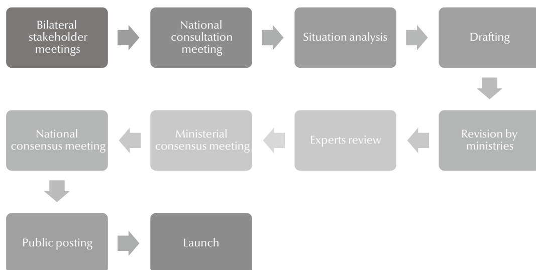
Figure 1. Development process of the Inter-ministerial Substance Use Response Strategy for Lebanon 2016–2021

The first draft of the Strategy was developed based on the situation analysis and in line with the WHO Regional Framework for Strengthening Public Health Response to Substance Use. Six domains of action were set with goals for each domain that address the identified critical issues to the strengthening of the substance use response in Lebanon. Strategic objectives were defined under every domain as key measures for the successful achievement of the set goals. An implementation plan was developed in which, for each objective, defined actions were identified with specification of the main actors to be involved in their implementation and the time frame for their achievement. Once the first draft was finalized, it was sent for revision to all involved ministries: Ministries of Social Affairs, Education, Interior