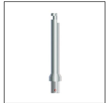
RHD2.5 Hex Driver

The RHD2.5 Hex Driver is used to carry and drive the implant into the osteotomy by connecting to the Fixture Mount/Transfer or directly to the implant. This hex driver is compatible with all 2.5 mm platform sizes of Tapered Screw-Vent®, Trabecular Metal™, SwissPlus®, Tapered SwissPlus®, and Ad-Vent® Implants. Two instruments, RH2.5 and RHL2.5, may be utilized as alternatives to the RHD2.5. Please refer to the respective Surgical Manuals for proper instructions.