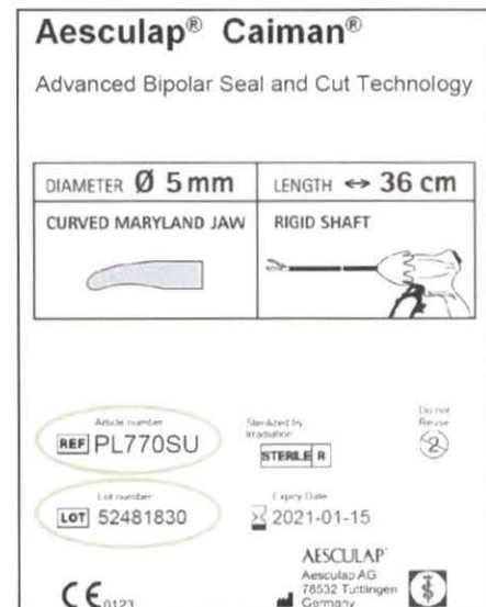
Figure 1: Label sterile blister PL770SU of affected batch 52481830

Due to the deviation from the product specification there is the possibility that insufficient coagulation might lead to intraoperative or postoperative bleeding.