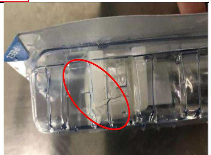
Fig 2. Inner Tray cracks near the plug