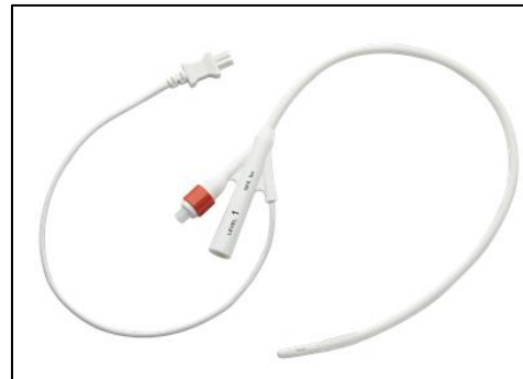
Figure 1 – Affected Product