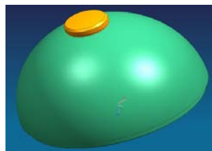
Figure 1: Apex HE thread through the cup