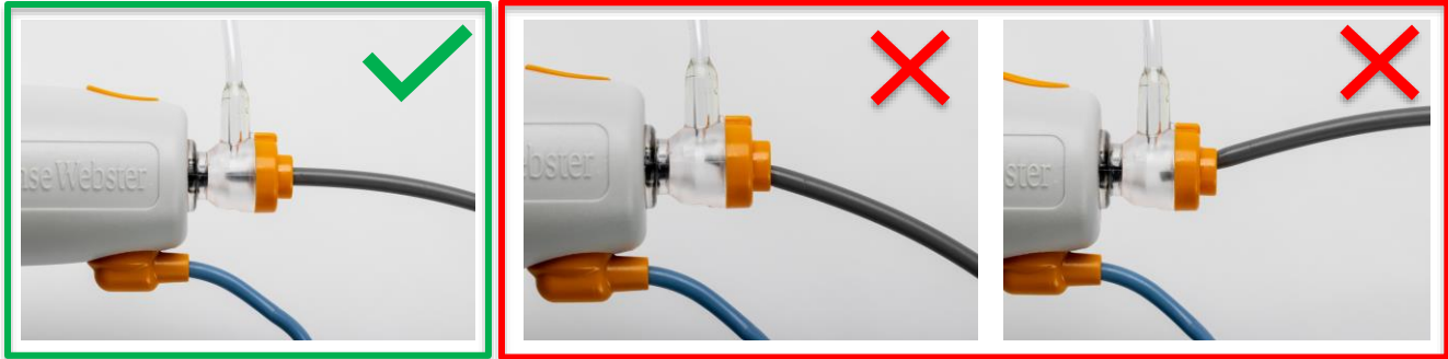
a. Correct dilator insertion