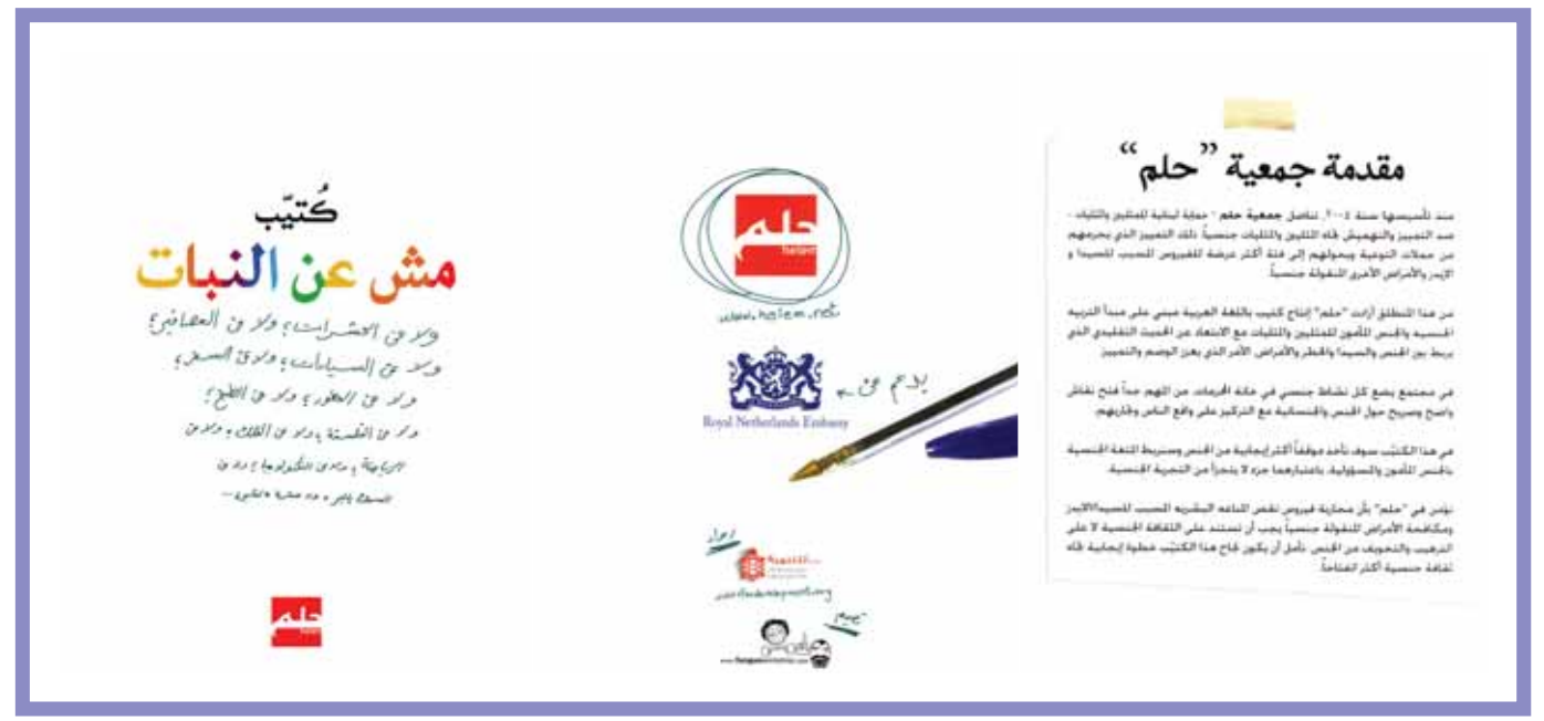
Figure 5: Sexual health booklet

Based on the outcome of the needs assessment conducted by Helem, and to further assess the needs of the LGBT population in Lebanon for specific educational materials, Helem conducted additional interviews with diverse subgroups of the LGBT population. This research and the resulting development of a sexual health booklet (Figure 5) were funded by the Dutch Embassy. Results of the study provided a clear view for the development of tailored IEC material for this community. In particular, the target population articulated the need to link information with social stigma. Thus careful attempts were pursued to examine relevant issues in the sexual health booklet from a social perspective. Each chapter draws on a specific scenario, presents relevant scientific information, and elaborates on associated social difficulties including stigma and means of resolving these issues. This project was carried out during the years 2005 to 2006.