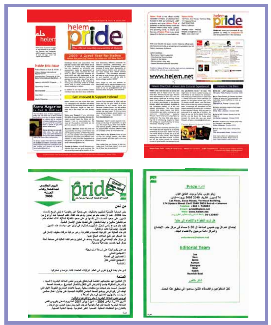
Figure 2: Helem's 'Pride' newsletter

The project also included the publication of a monthly newsletter called 'Pride' (Figure 2), and a quarterly magazine, 'Barra' (Figure 3), which is the first LGBT magazine published in the MENA region. Both the newsletter and the magazine are sent electronically to those individuals on Helem's mailing list and can be accessed on the Helem website. They can also be located at select outlets. Helem also has created a brochure about the organization and the services they offer (Figure 4). The last portion of the project included the creation and management of Helem's website, http://www.helem.net.