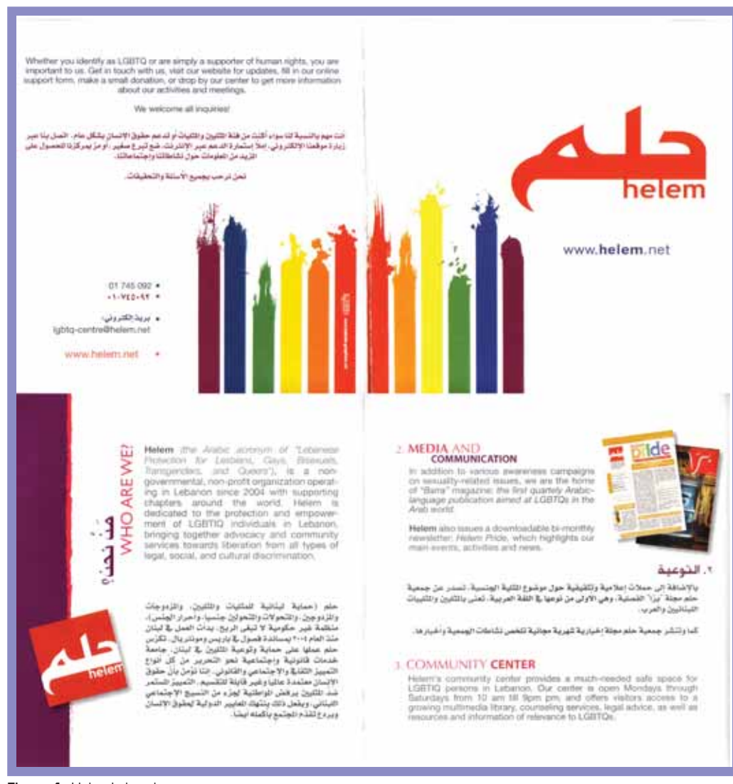
Figure 4: Helem's brochure