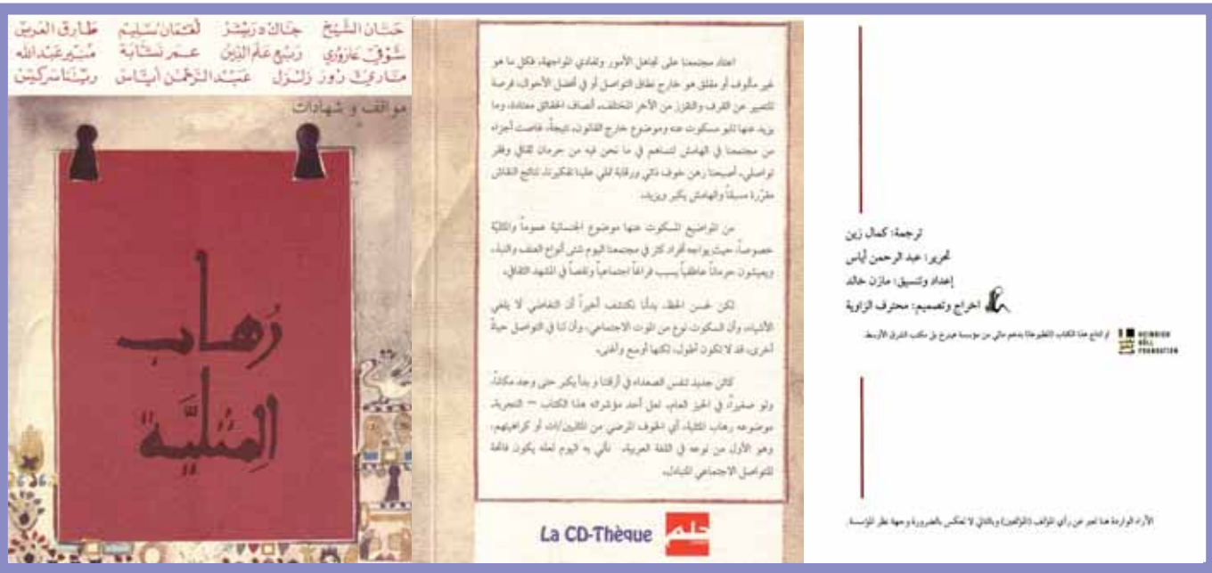
Figure 7: 'Homophobia': Views and opinions

In mid-2006 another hotline and referral training was funded by the International HIV/AIDS Alliance and UNAIDS, and was coordinated by NAP and conducted by Helem and SIDC. Twelve participants attended this workshop and all twelve are currently working on providing the hotline service. The hotline working hours were extended three hours after this training so that Helem could receive phone calls until 9pm. By extending the hotline working hours, Helem doubled the number of beneficiaries they reached, as they received 220 more phone calls during those extra three hours.