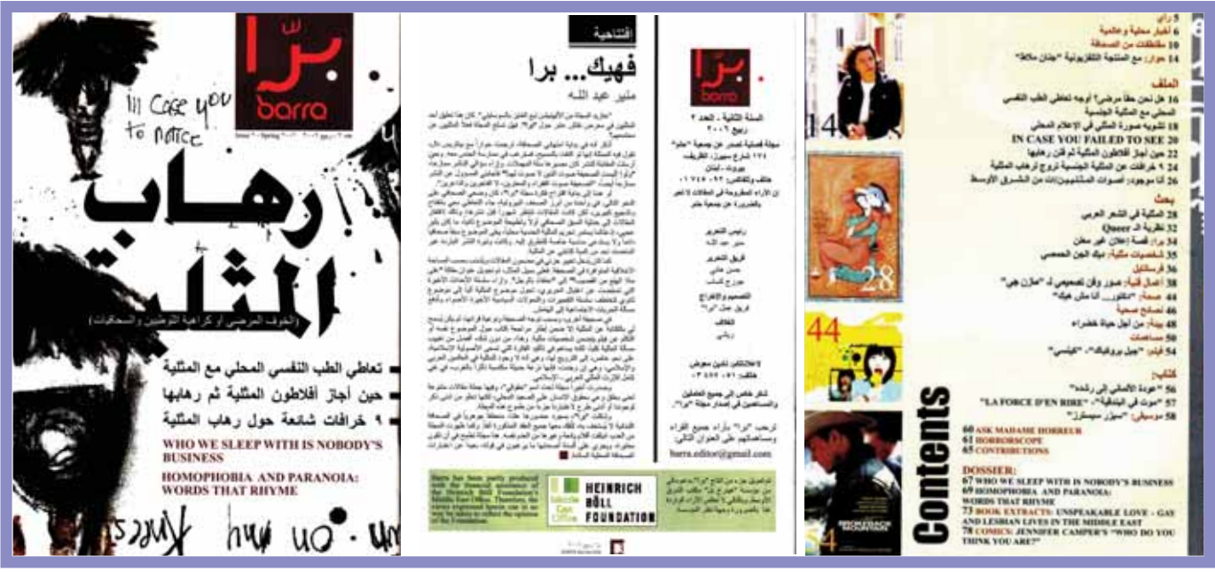
Figure 3: Helem's 'Barra' magazine